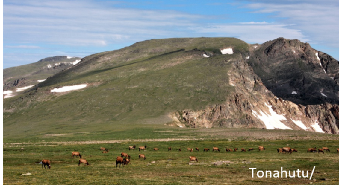
Tonahutu/ N. Inlet