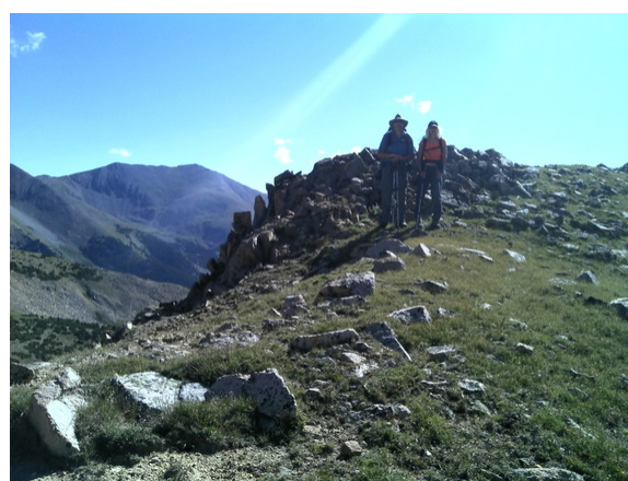
Colorado Trail August

Photos – Why not feature one of your backpacking photos in our newsletter? Just send to LKL14er@comcast.net with your name, the location and date. We will give you all the credit!