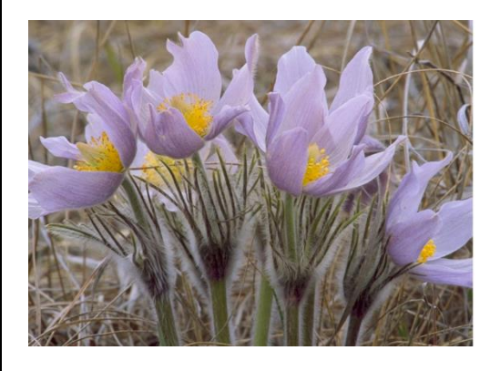
Pulsatilla patens (Pasque Flower)