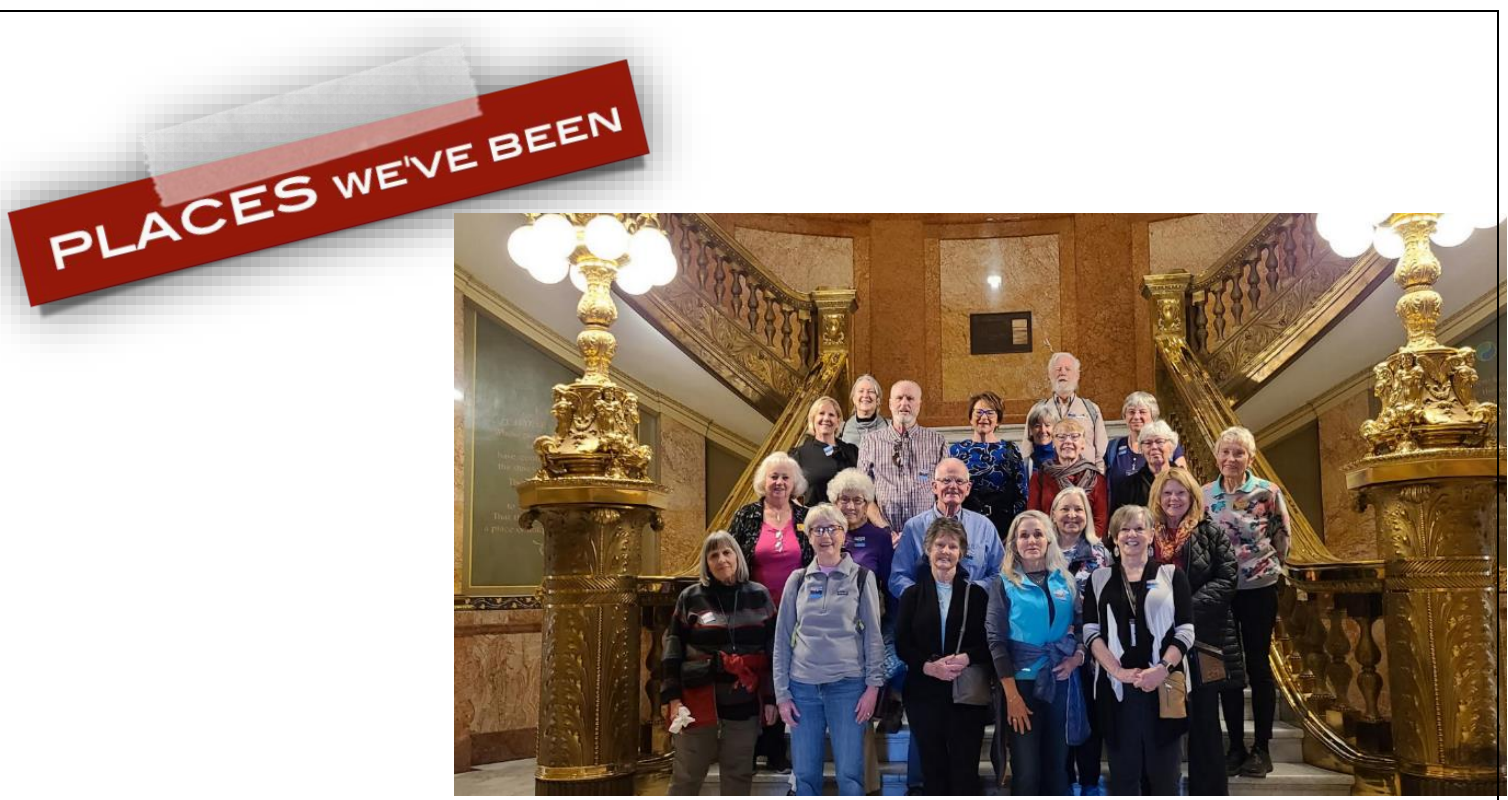
RMOTHG group tour of the Colorado State Capital on March 12,2024