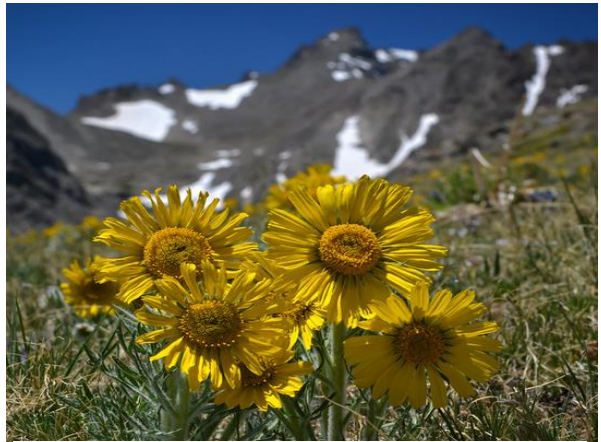
The Old Man on the Mountain is not only one of the first flowers to bloom as the snow recedes it is also one of Colorado's largest wildflowers.