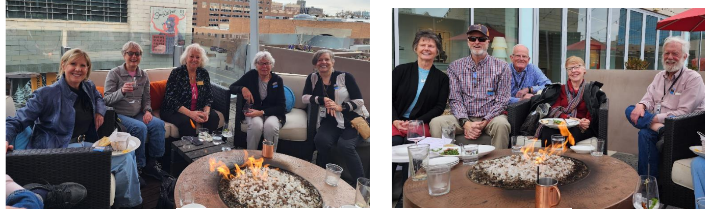
Post-tour Happy Hour on the terrace at the Art Hotel