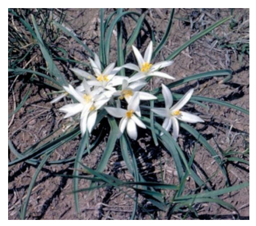
Leucocrinum montanum (Star Lily)