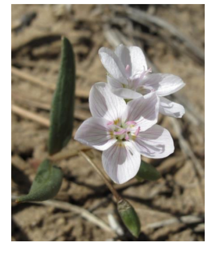
Claytoni lanceolata var. rosea (Rocky Mountain Spring Beauty)