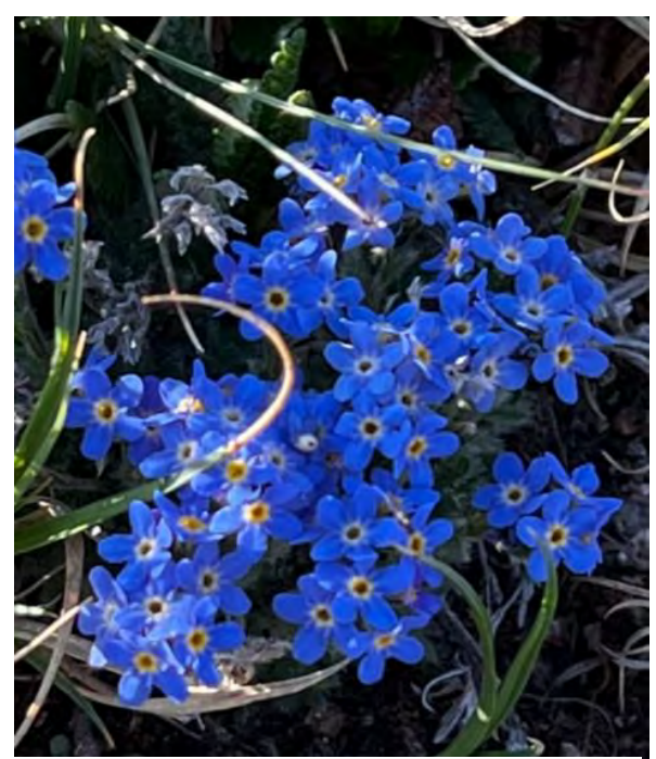
Forget-Me-Nots on Mt. Flora