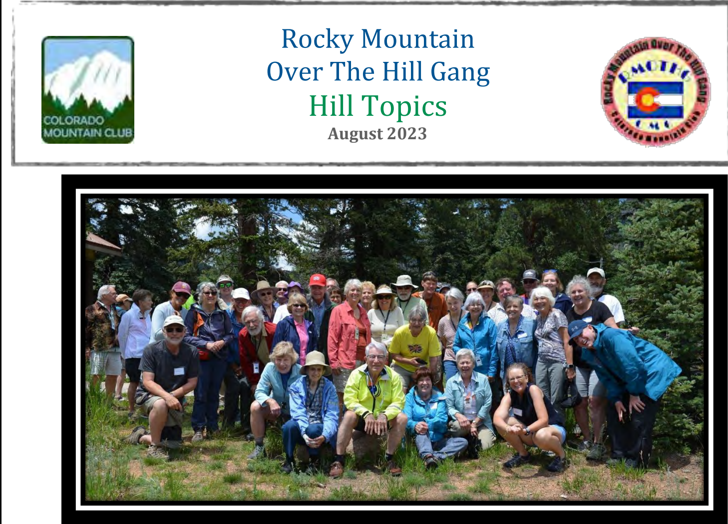
Annual Picnic at Staunton State Park