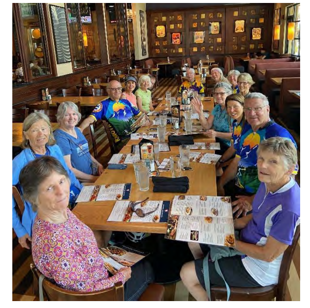
Après Bike Ride Lunch