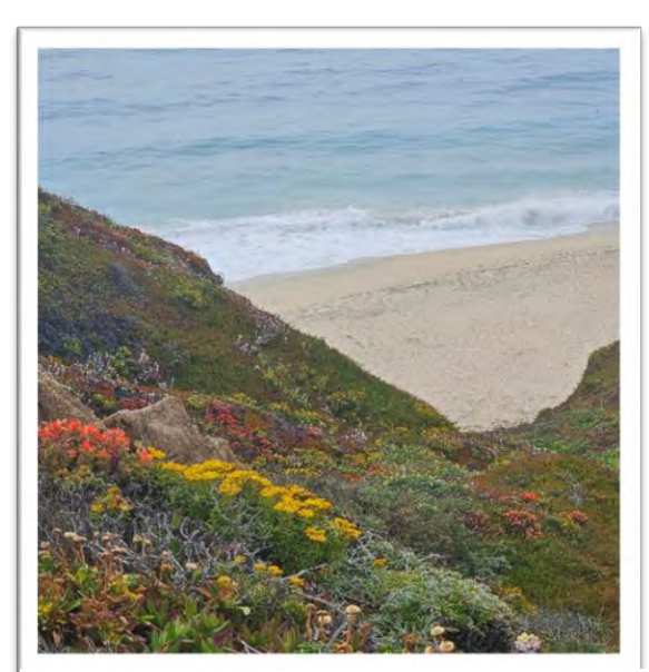
Monterey Penninsula wildflowers