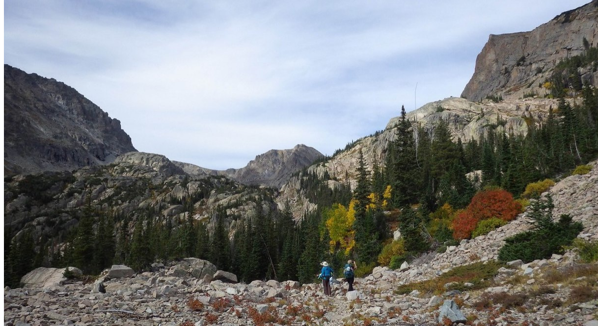
Above Ouzel Lake, RMNP, August 2017