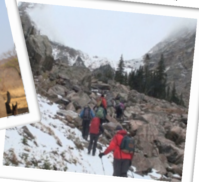
GLACIER GORGE