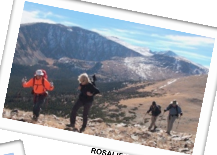
ROSALIE PEAK