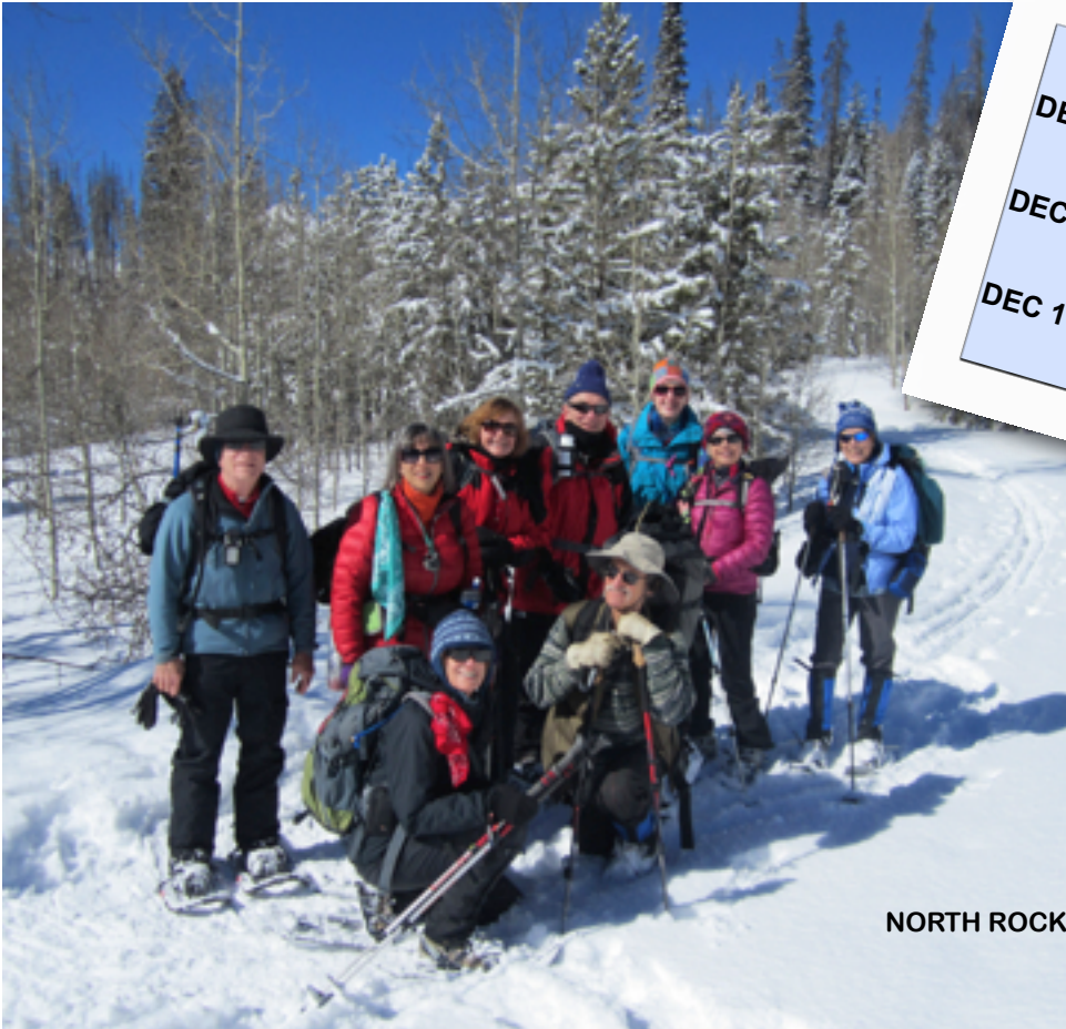
NORTH ROCK CREEK LAST WINTER

DEC 3 DEAD HORSE CREEK (A) PARMALEE GULCH (A) DEC 10 RACCOON CREEK (A) KEYSTONE GULCH (B) DEC 17 CONEY FLATS TRAIL (A) SCOTT GOMER (A)