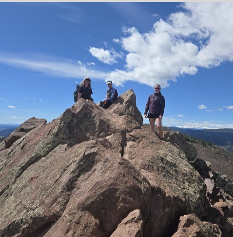
Bear Pk