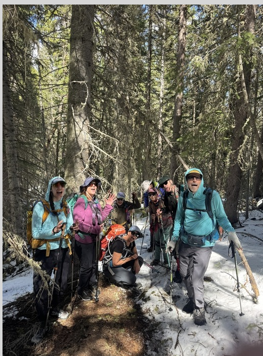
RMNP Blue Bird Lk led and pic by Wayne Howell