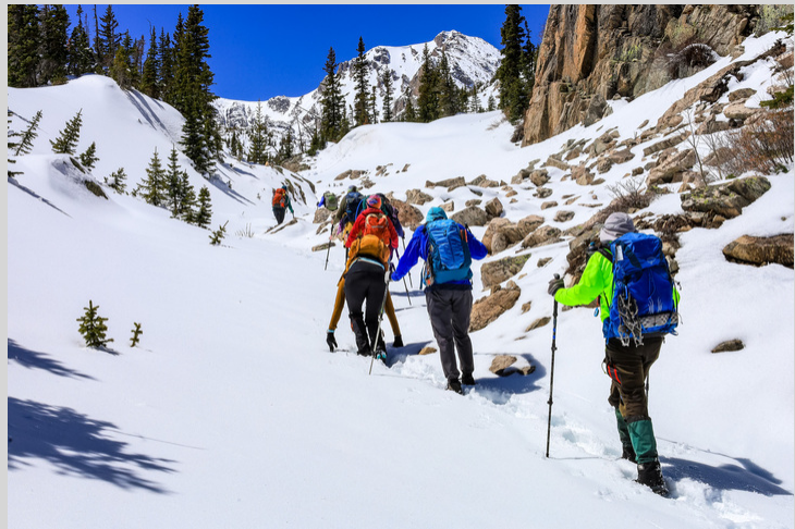
RMNP Blue Bird Lake