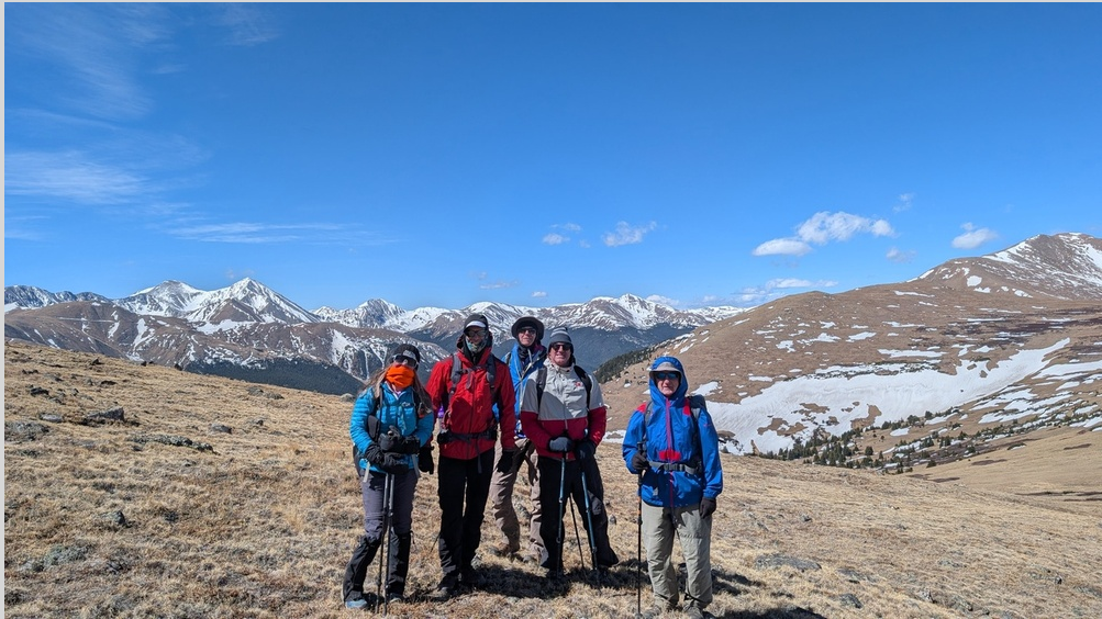
Republican and Sherman led and