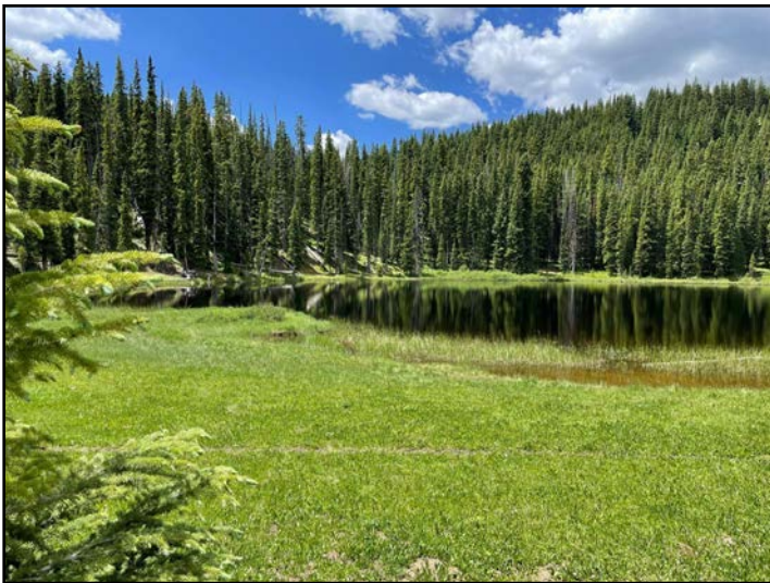
... and to beautiful Wheeler Lakes