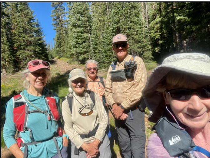
Redemption at Mahan Lake