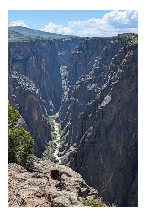
from the North Vista Trail, Black Canyon National Park, during a CMC outing last year.

The San Juan Mountains Association announced that shifts are now open for Ice Lake Volunteer Ambassadors starting May 20, 2025 and running through September 14, 2025. Training will take place on May 20, 2025 from 5:00 to 7:00 p.m. at the San Juan National Forest Supervisor's Office at 15 Burnett Ct. in Durango. Visit <a href="https://www.sjma.org">www.sjma.org</a> for more information.