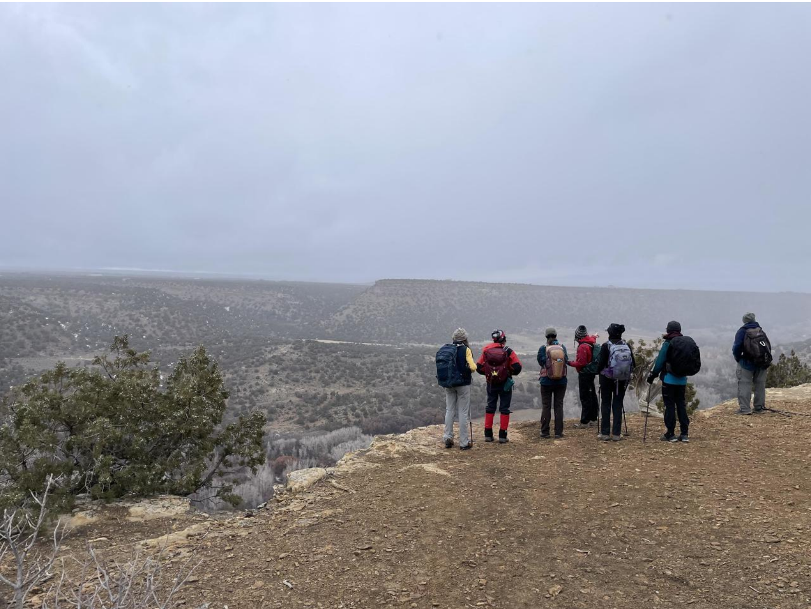
Buzzard Gulch CMC hiking trip close to Montrose, at the overlook with snowflakes falling. See below on how to submit your favorite photo for the newsletter!