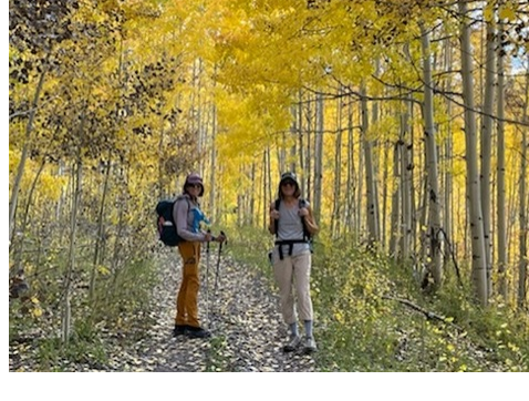
CMC hike to Owl Creek Pass close to Ridgway.

See below on how to submit your favorite photo for the newsletter!