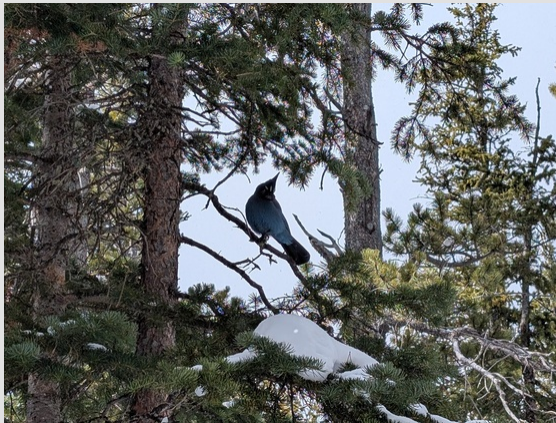
Brainard Lake Isabel