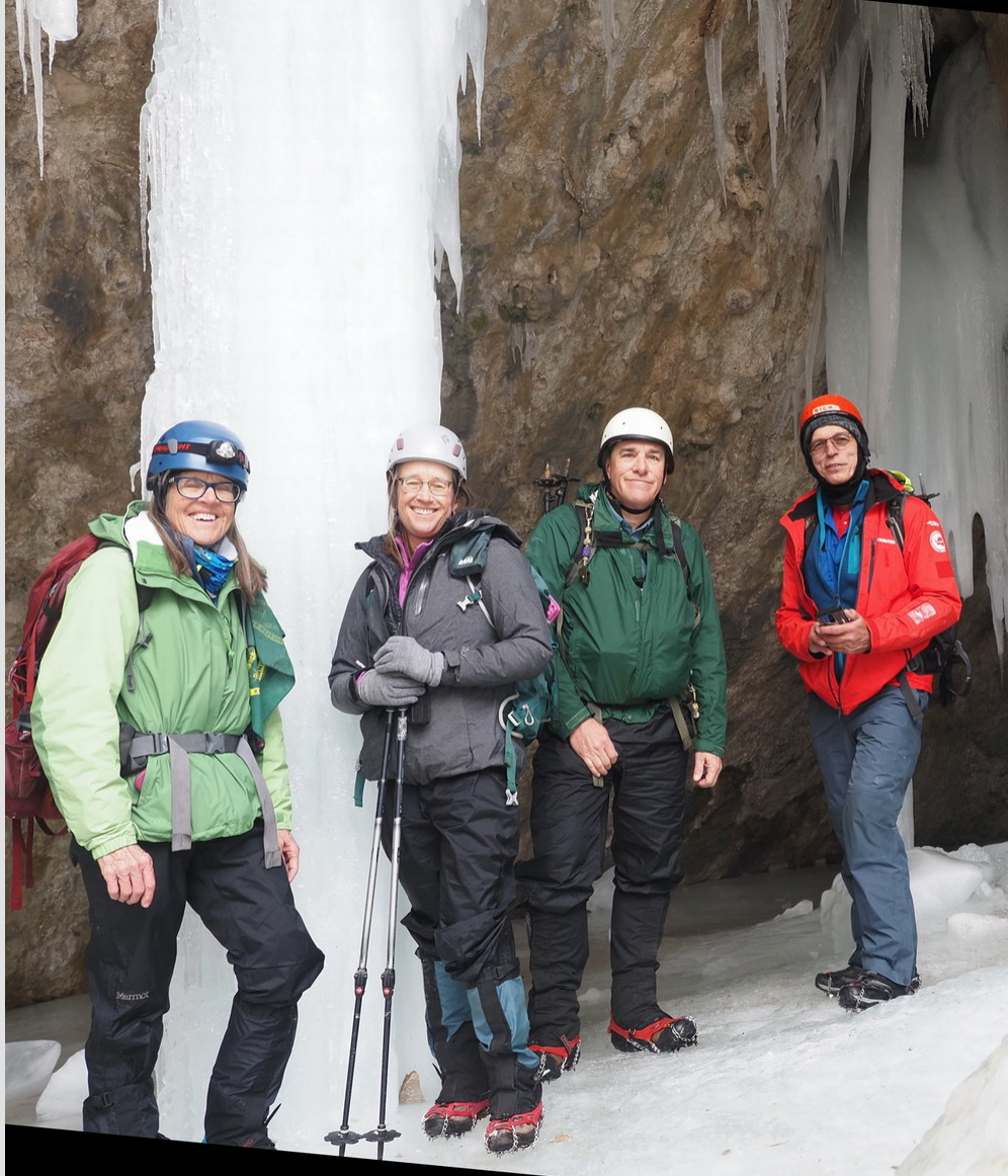
Rifle Ice Caves and Falls led and pic by Rich Schiebel