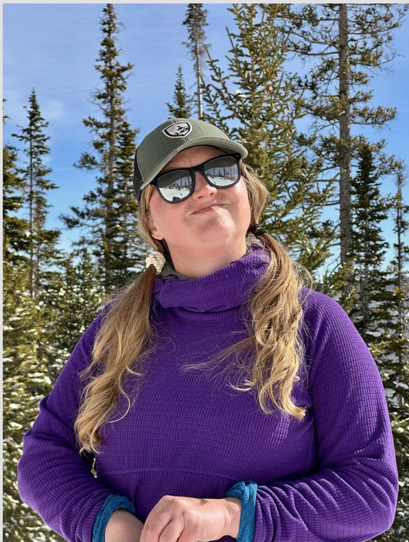
Leland, Fool and King Creek