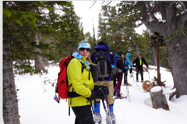
Brainard Lake Isabel