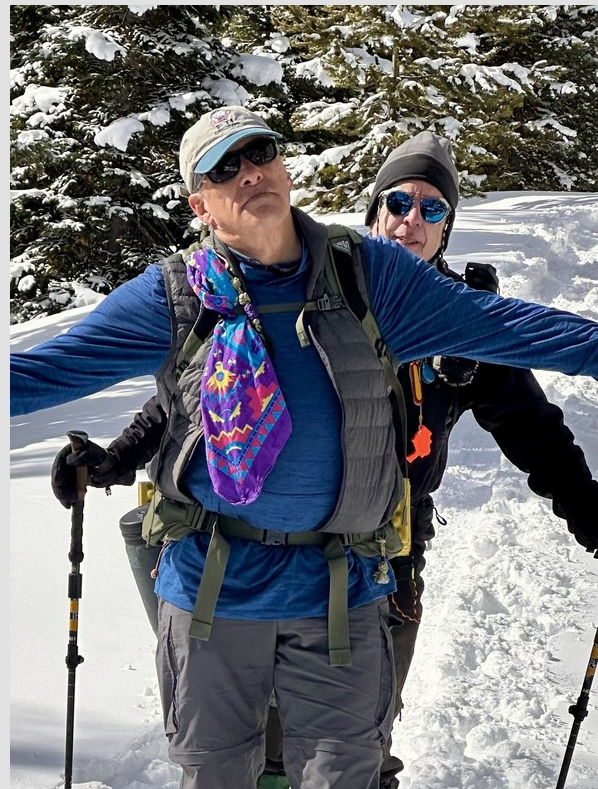
Leland, Fool and King Creek