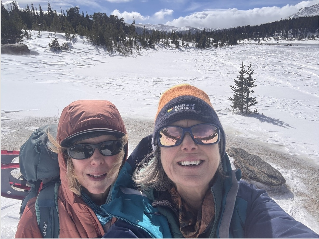
RMNP Sandbeach Lake