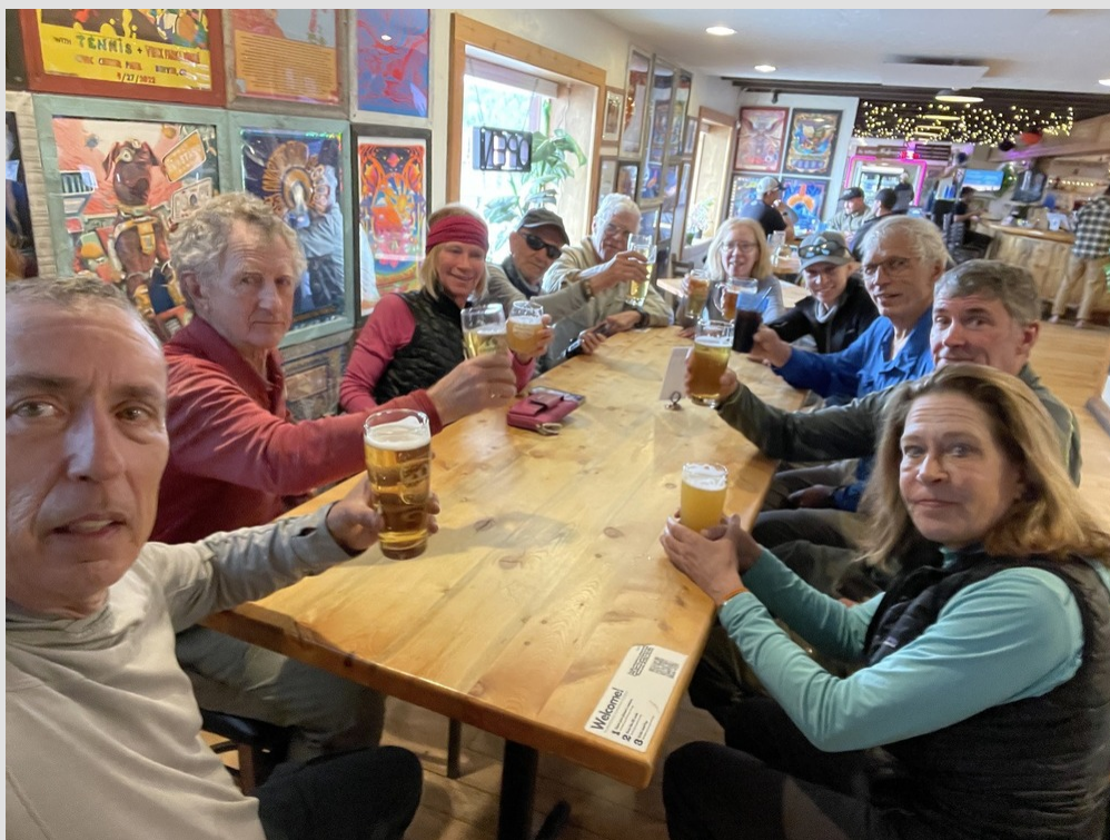
Apres Long Scraggy