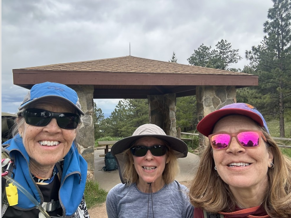
An Extra Loop Mount Falcon pic by Jan Brady.