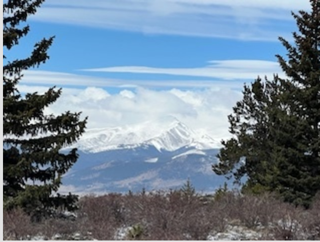
Twin Cones