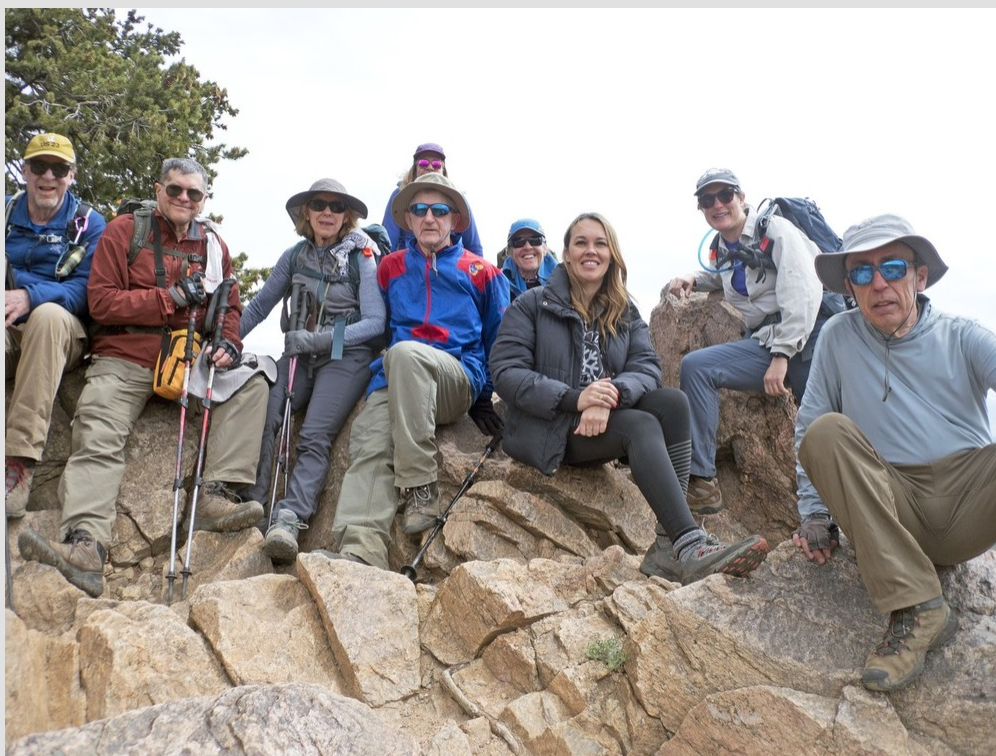
Mount Falcon led and pic by Jim Guerra