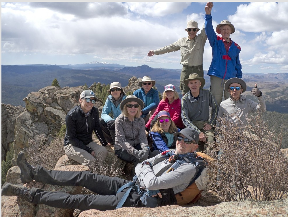
Long Scraggy led and