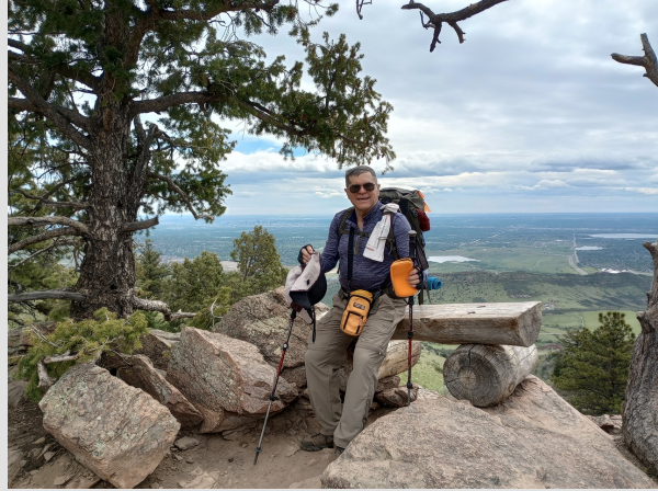
Mount Falcon