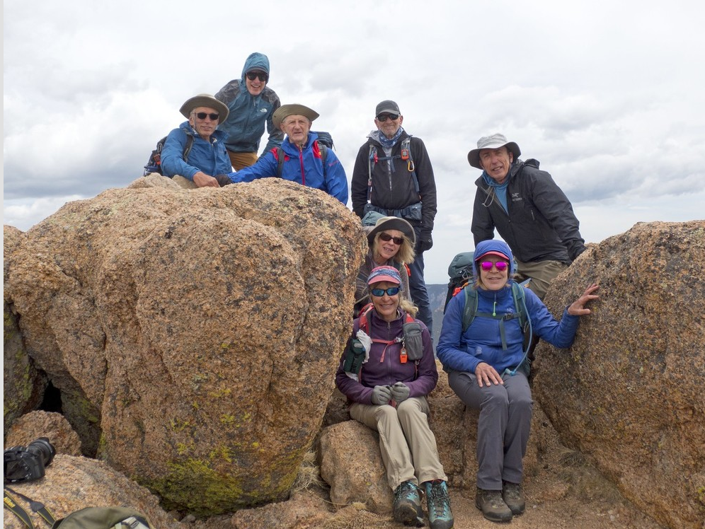
Bison Peak led and