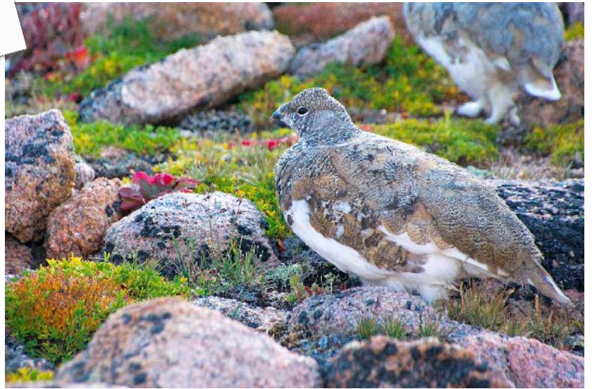
CAN YOU FIND THE PTARMIGAN?