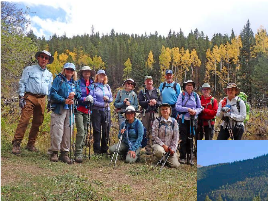
THREE MILE CREEK