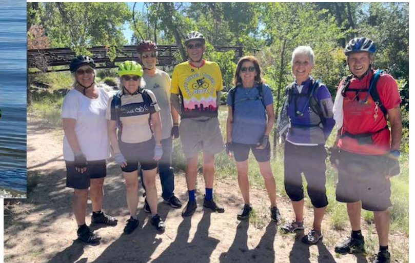
TERRAPINS ON CHERRY CREEK NORTH