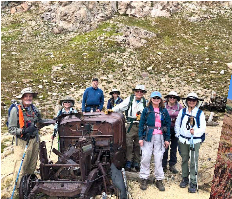
BUTLER GULCH GEOLOGY