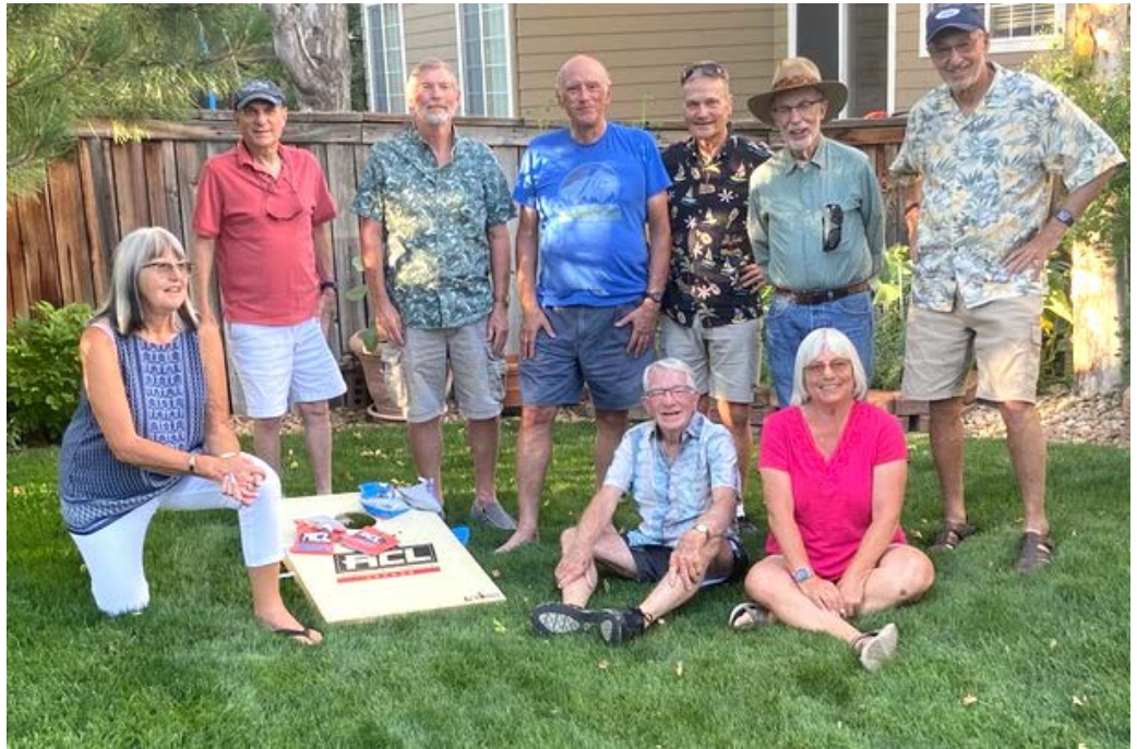
ALL OF THE RMOTHG 2022 BIKE TRIP LEADERS ENJOYING TIME TOGETHER OFF THEIR BIKES