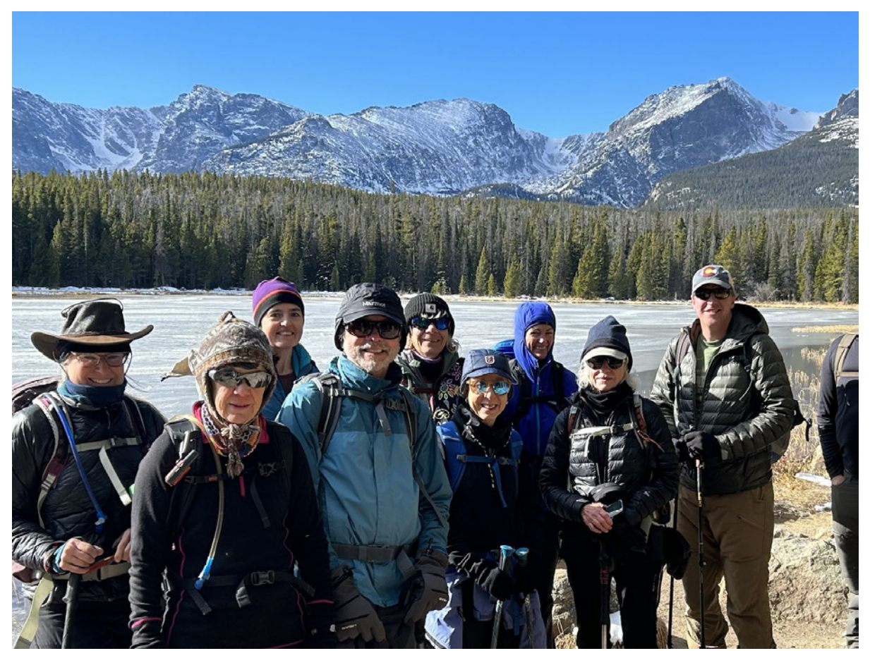
Who's ready for SNOW?!?

Fall is quickly transitioning to winter and CMC members aren't slowing down their eagerness to get outside. This photo includes members of the Northern Colorado Group on their outing to Bierstadt Lake to Cub Lake via Mill Creek including Mill Creek Basin. They reported great weather, great scenery, and great company. Total distance travelled was 8.3 miles.