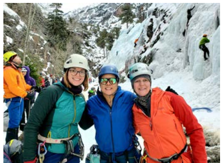
Climb to new heights (literally) with